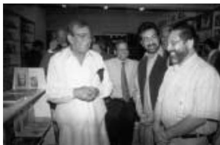
At the model bookshop (Pakistan)