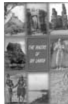
The Rulers of Sri Lanka (Sri Lanka)

Nepal in 1950, the then Prime Minister Mohun Shumser sought the help of the Swiss Government for a geologist ostensibly to help find precious mineral deposits. Hagen came to Nepal in October 1950 and undertook long and hazardous treks all over the mountainous parts of the Kingdom for several years.