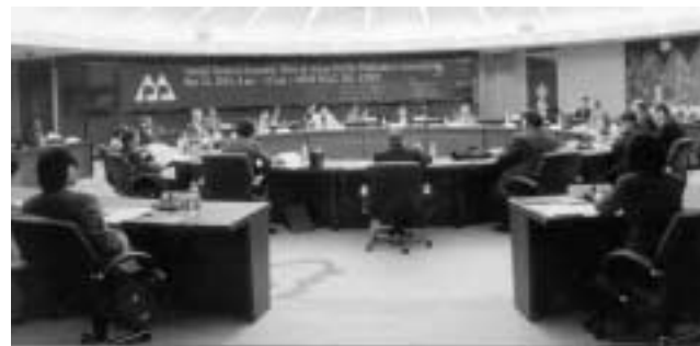
Annual General Meeting of APPA (Rep. of Korea)

Internet and e-mail services to the children. The library plans to build a collection of 10,000 books classified for primary, lower secondary and secondary children sections. The premise has also a seminar hall and a separate Japanese section. The library aims at the developing the reading habit among children and encouraging them in creative educational activities.