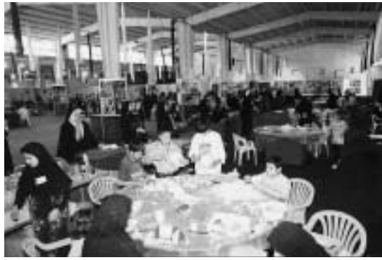
Children enjoying a workshop at the 14th Tehran International Book Fair (Iran)

Also on the agenda is a plan to improve and increase the number of bookshops, libraries, and mobile libraries in the country. The National Book Trust has been identified as the nodal agency to organise the Year of Books.