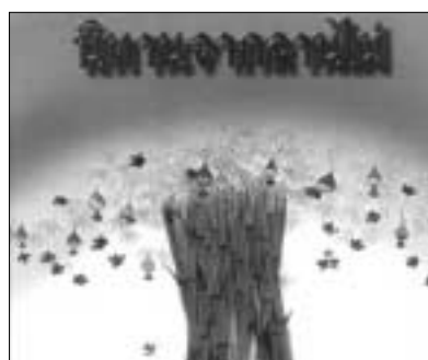
A Tale from Bamboo Ground (Thailand)

A Tale from Bamboo Ground by Sirimala Suwanphokhin (text), Preprem Phlianbham-rung (illustrations), Kurusapa Business Organization, 2000, 203 x 266 mm, 23 pages, 90 Baht (approx. US$2.00), ISBN: 974-00-8307-2