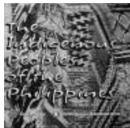
The Indigenous Peoples of the Philippines (Philippines)