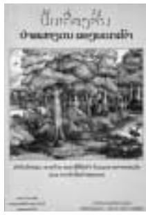
Our Forest Reserves (Lao PDR)