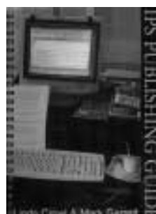
IPS Publishing Guide (Fiji)