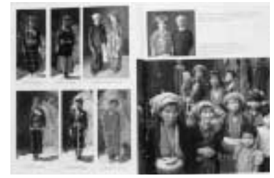
Page-spread from National Ethnic Groups of Myanmar (Myanmar)

People wellgrounded in sciences are usually dissatisfied with the novel, saying that some of the theories implied in the novel were wrongly interpreted. Controversial though it may be, many readers find Supernova really dazzling.