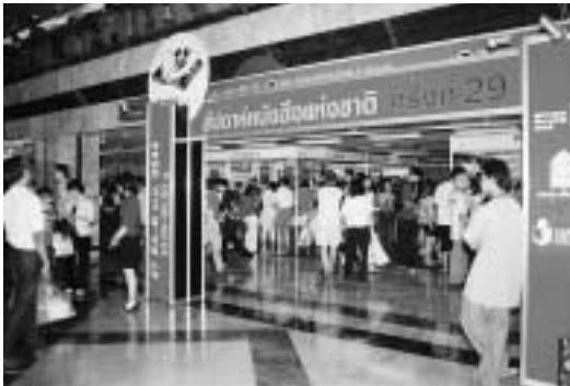
29th National Book Fair (Thailand)

on reproduction and transmission of books and contents in an electronic form recently. A current copyright law allows free reproduction and transmission of books and contents in an electronic form between libraries, which has aroused uproar from a lot of people in the publishing sector and related industries and also has been considered as seriously flawed due to the fact that it does not secure the copyrights. In an effort to respond to the request from publishers and to improve the copyright law, they proposed the bill with amended provision, under which transmission and reproduction of electronic files of books only within a library concerned will be legal. Before presenting the bill in the National Assembly, they are currently trying to collect as varied opinions as possible from various fields on this bill.