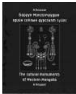
The Cultural Monuments of Western Mongolia (Mongolia)