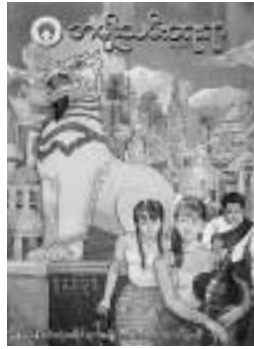
Cover page of Women's Day Annual (Myanmar)

Regarding the scale, publishers with a capital exceeding 100 million yen account for 249, which include publishing