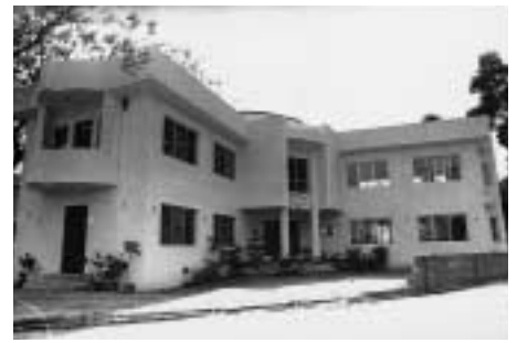
The newly completed Children's Library in Kathmandu (Nepal)

A ceremony to present prizes to winners in the literature, music, painting and cartoon competitions to mark the International Day Against Drug Abuse and Illicit Trafficking, organised by Central Committee for Drug Abuse Control, was held at the administrative office of the newly opened Drug Elimina-