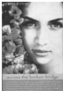
Across the Broken Bridge (Pakistan)