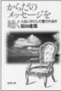
Listening to the Messages from the Body (Japan)