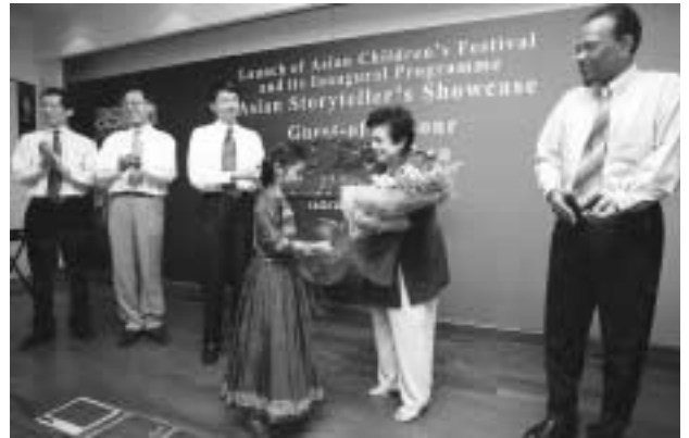
Asian Children's Festival (ACF) 2000 (Singapore)