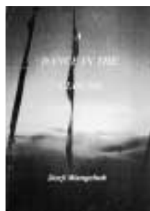
A Dance in the Clouds (Bhutan)

Men from the island of Niue became part of New Zealand's contingent of soldiers to fight in World War I. Used to living on their plentiful island in the midst of the vast Pacific Ocean, brave Niueans were shipped first to New Zealand, then to Africa, then to Europe before they were allowed to return home. This volume, written in English and translated into Niuean tells of their preparation for war