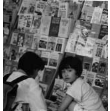
Children at a bookstore (Viet Nam)

This fair attracted about 500,000 visitors and over 400 publishers throughout the country. There was an exhibition which displayed books written by His Majesty King Bhumibol Adulyadej, Her Royal Highness Princess Maha Chakri Sirindhorn and Her Royal Highness Princess Galyani Vadhana, and books awarded in the 2001 National Book Contest, as well as symposiums, seminars, training, workshops and discussions.