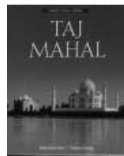
Taj Mahal from The Inside India Series (India)

and departure from Niue. It discusses their training to become soldiers and their journey to Egypt then France and England before returning to Niue. Finally, the book addresses remembrance, for the Niueans proudly celebrate ANZAC day each year and maintain a Returned Soldiers Association. This book was sold out within a day on Niue, and met great acclaim in New Zealand, where many Niueans now make their home.