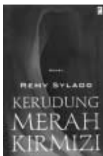
"Scarlet Red Hood", winning novel of Khatulistiwa Award (Indonesia)