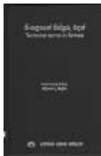
Technical Terms in Sinhala (Sri Lanka)