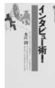
Technique of Interviewing (Japan)

Javanese Epoch, which other researchers may not be willing to touch. He remains to be an archeologist—neither an historian nor an anthropologist—who tries to reconstruct the cultural changes, firstly, from the viewpoint of the material culture. Its result is a form of a mosaic full of colours, assembling diverse data of seven centuries concerning the Ancient Javanese civilization.