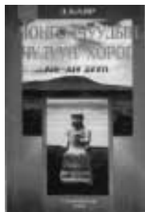
Stone Statues of the Mongols (Mongolia)