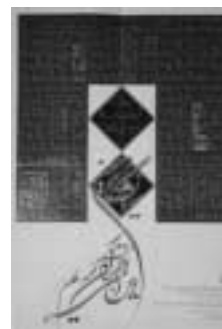
10th International Quran Exhibition poster (Iran)

really helped to inculcate in the mind of the large variegated cavalcade of new book lovers a new interest in the magic of print.