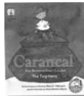
Adventures of Carançal, the Tiny Hero (Philippines)