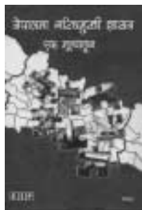
Pro-poor Governance Assessment Nepal (Nepal)