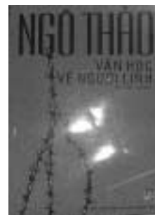
Literature on Soldiers (Viet Nam)