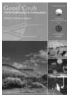
Good Grub: Food for Healthy People and a Healthy Planet (Australia)