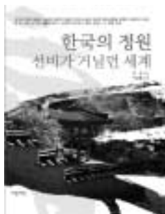
The Amazing Beauty of the Korean Garden (Rep. of Korea)