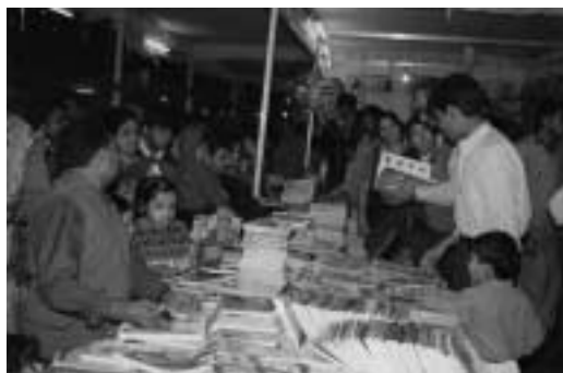
Jaipur Book Fair, Rajasthan (India)