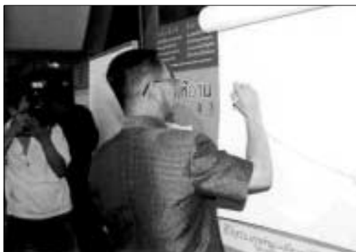
Pongpol Adireksarn, Minister of Education, writing his list of favourite books on the communique of the campaign "Year of Reading and Learning Promotion" (Thailand)