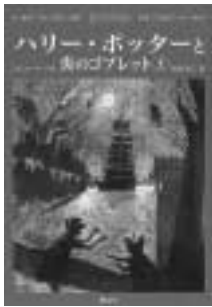
Japanese version of "Harry Potter and the Goblet of Fire" (Japan)