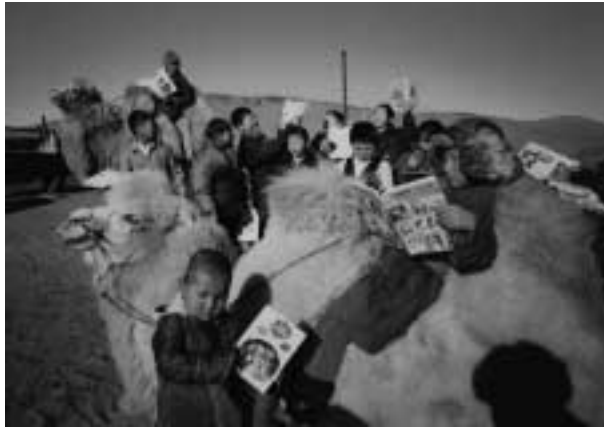
Children's Book Fair in the Gobi (Mongolia)