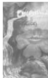
The Soul of Song (Pakistan)