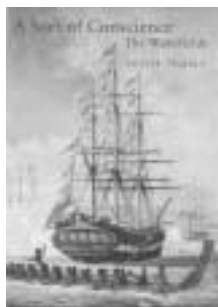
A Sort of Conscience: The Wakefields (New Zealand)