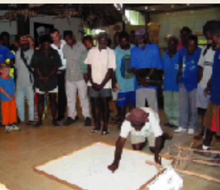
Vanuatu Sand Drawing © Erica Pitt

Vanuatu's sand drawing tradition is not merely a time-honoured artistic expression, but a veritable means of communication indigenous to the central and northern islands of the archipelago.