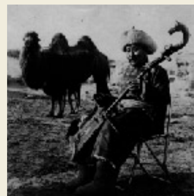
The Morin Khuur

For more than seven centuries, the cherished two-string horsehead fiddle called morin khuur has figured prominently in the culture of Mongolia's nomad population.