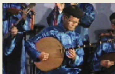
Nha Nhac