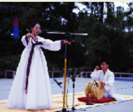
The Pansori Epic Chant