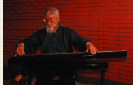
The Art of Guqin Music © Music Research Institute of Chinese Academy of Arts