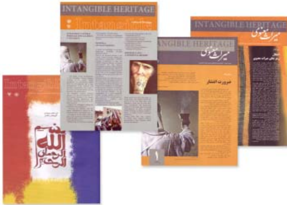
Publication of a Bilingual Periodical on Intangible Cultural Heritage in collaboration with UNESCO National Commission in Iran