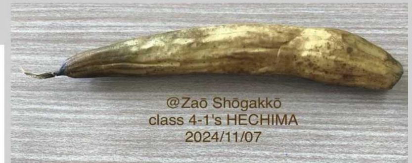
@Zaō Shōgakkō class 4-1's HECHIMA 2024/11/07