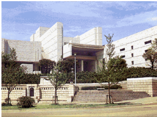
(the Supreme Court of Japan)